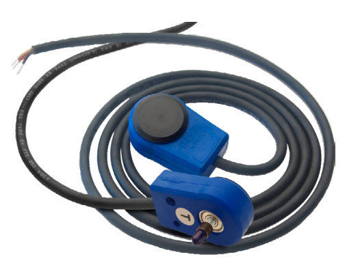
Optimized for use with the Dart PU Series Speed Sensor