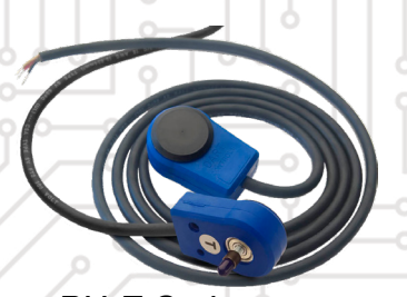
PU-E Series Performance-matched for use with the MD Series